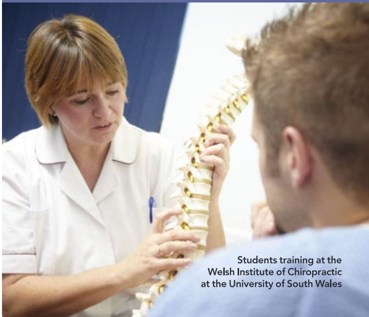
Students training at the Welsh Institute of Chiropractic at the University of South Wales

Chiropractors are experts in diagnosing and treating spine problems